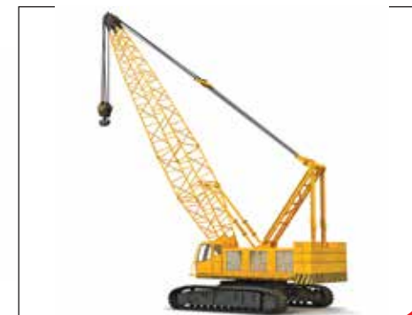
Crawler Crane (Up to 70 Ton Capacity)