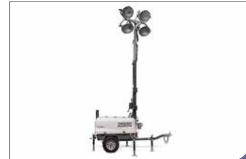
Tower Lights (1000W)