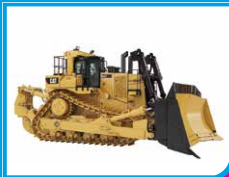
Dozer (D8 and D9)