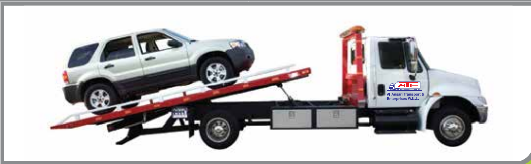
Break Down (3 Ton to 15 Ton Capacity)