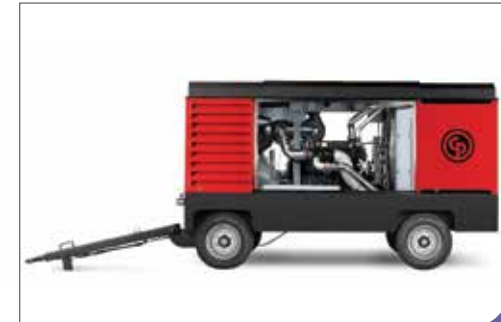
Compressor (Up to 1250 CFM)