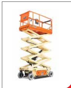
Scissor Lift (Up to 24m)