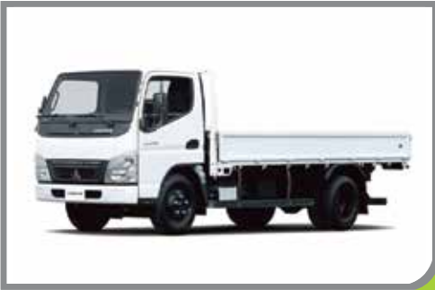
Pickups (3 to 5 Ton Capacity)