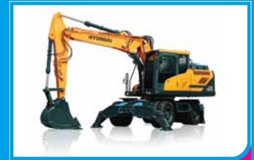
Wheel Excavator (6 Ton, 8 Ton & 22 Ton)