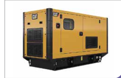
Generator (Up to 1250 KVA) Open & Sound Proof