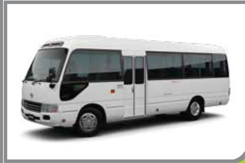
Bus (15, 32, 64 Seater)