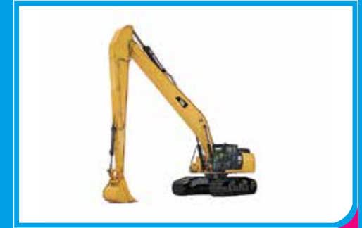
Long Boom Excavator (12m to 22m)