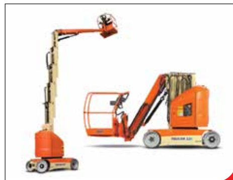
Boom Lift (Up to 12m)