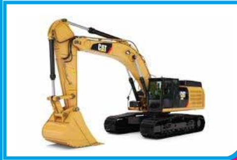
Chain Excavator (20 Ton to 50 Ton Capacity)