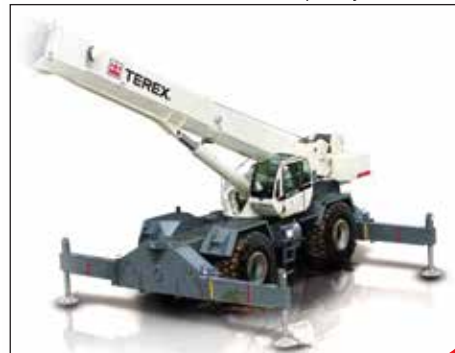
Rough Terrain Crane (40,50,55,60,Ton and 80 Ton Capacity)