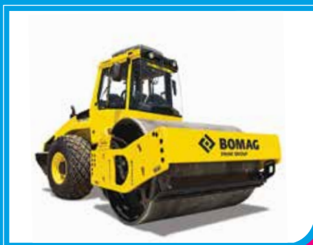
Roller (1 Ton to 12 Ton Capacity)