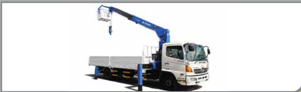
Boom Truck (3 Ton to 15 Ton Capacity)