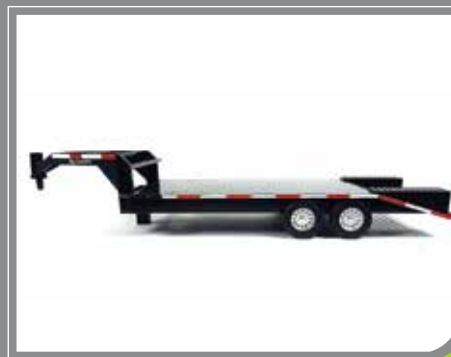
Lowbed (Up to 100 Ton Capacity)