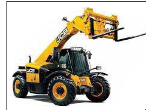
Telescopic Forklift (13m and 17m)