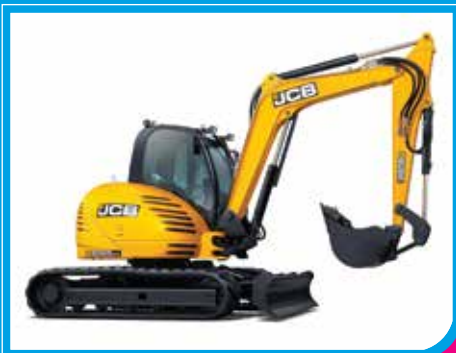
Mini Excavator (2 Ton, 3.5 Ton and 6 Ton Capacity)