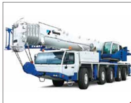
Mobile Crane (25,30,40,50,60,70,80,100, 110,120,150,160,200,250,300, Ton and 350 Ton Capacity)