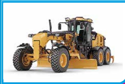
Grader (12H to 14H)