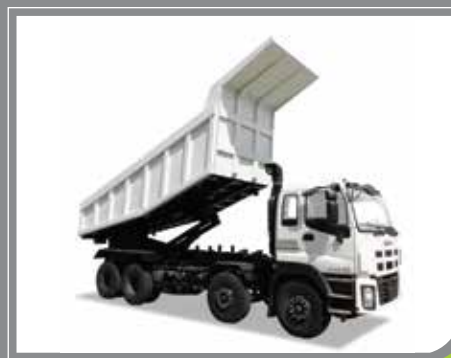
Dump Truck (19 cum to 32 cum)