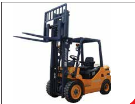
Forklift (3 to 15 Ton Capacity)