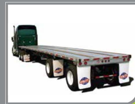
Flatbed Trailer (Up to 45 Ton Capacity)