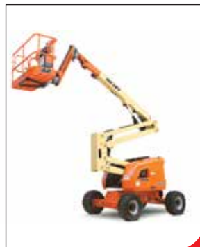
Articulated Man Lift (UP to 42m)