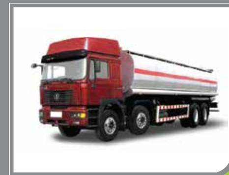
Tanker (Water & Sewage Up to 6000 GL)