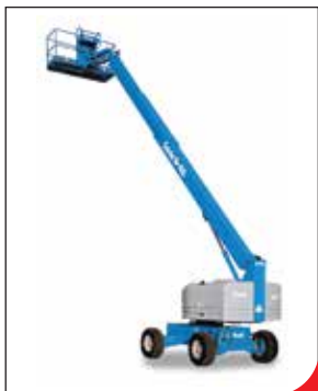
Man Lift (Up to 42m)